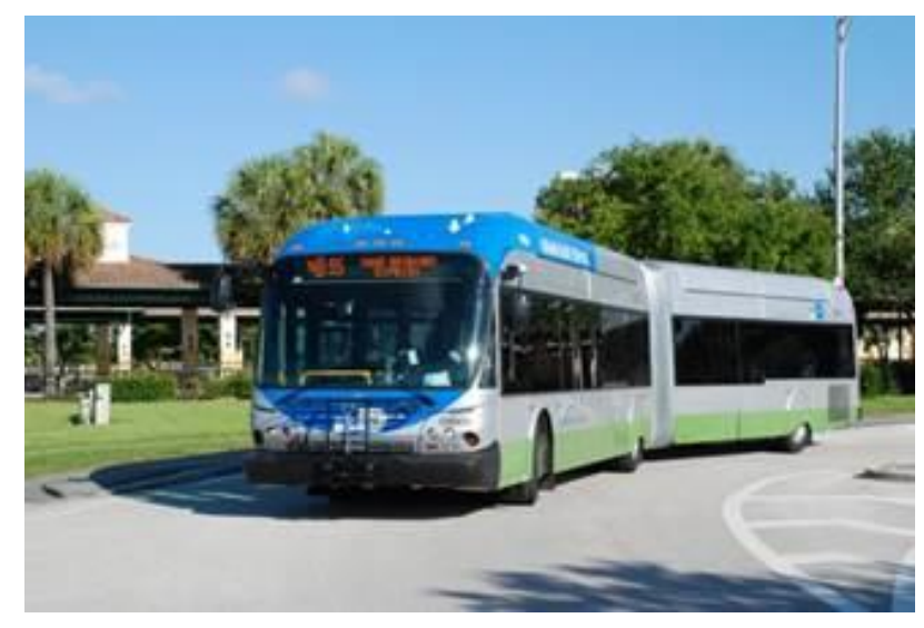
Miami-Dade/Broward 95 Express Bus.

Nationally-recognized freight planning cooperation