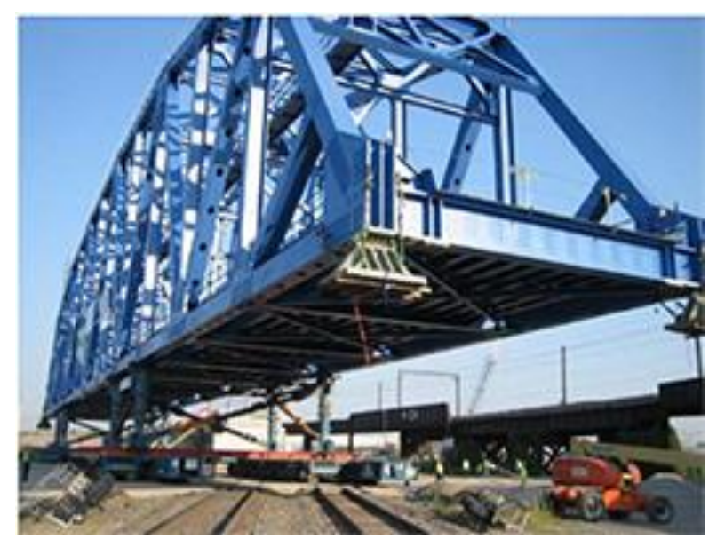
CREATE grade separation project GS15a under construction at 130th St. and Torrance Ave. in Chicago