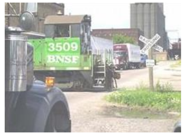
Image of freight train and motor carriers serving the Port of Duluth-Superior.