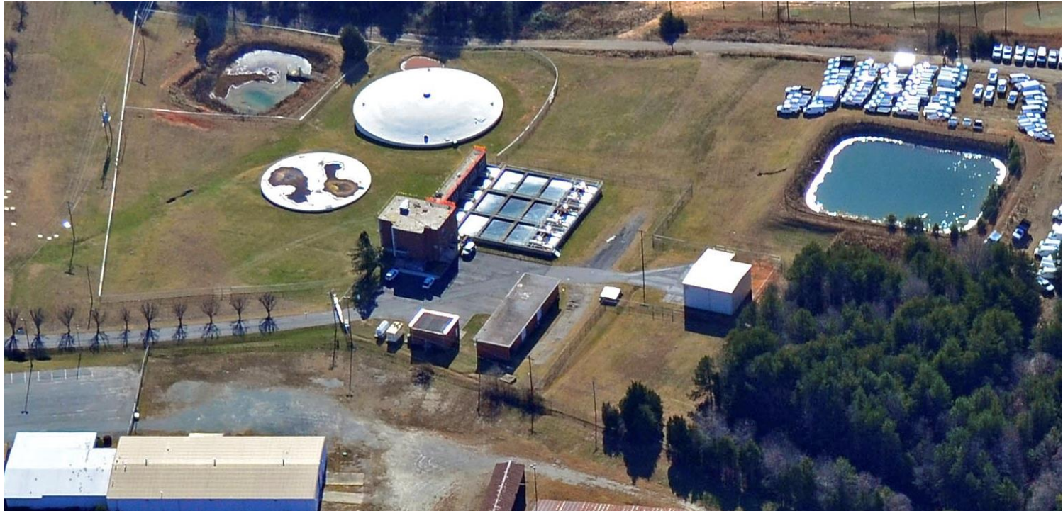
Water Treatment Plant #1