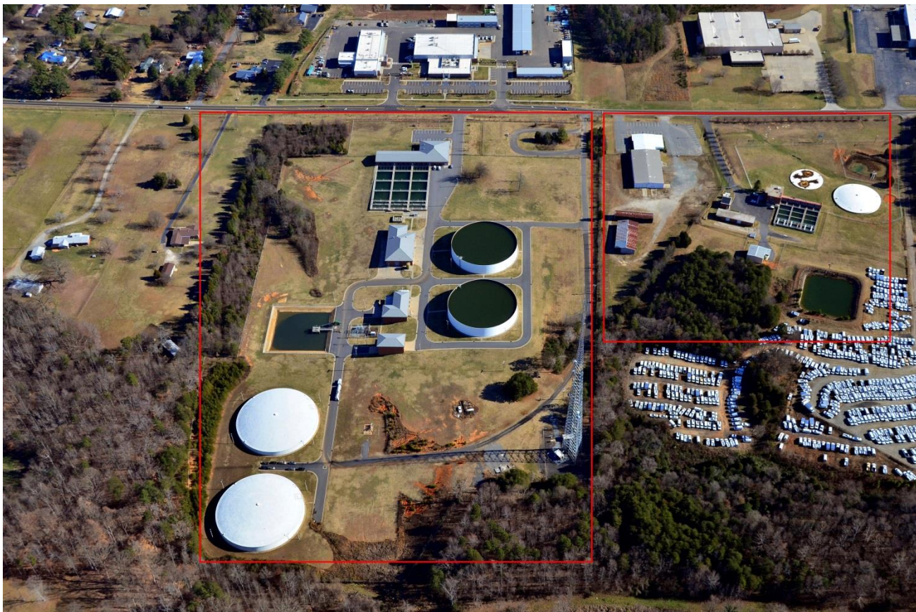
Water Treatment Plant #2