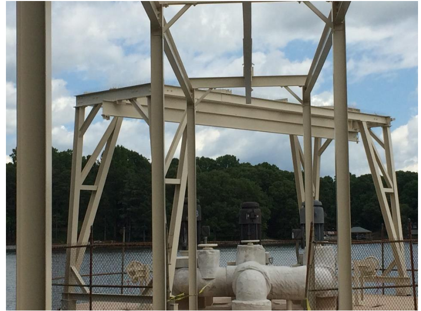
Raw Water Intake Rehab – Before & After